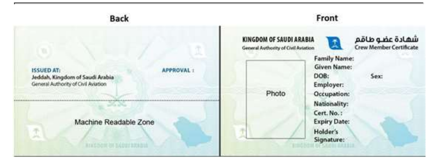
Figure 9.12.1.1, Sample CMC

Consult the GACA website for current version